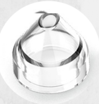
Small Elliptical Tip Intense pore cleanse, suitable for targeting curved areas, such as side of nose